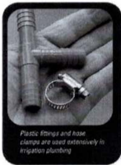
Plastic fittings and hose clamps are used extensively in irrigation plumbing.

Polyethylene tubing (PE) Polyethylene (PE) is used in residential plumbing for cold-water service piping. Because of its low cost, it's used extensively for irrigation. Sold in rolls, the pipe can be purchased from plumbing wholesalers and at many home improvement stores. Plastic barbed fittings and hose clamps are used in many residential applications to make connections, although some systems do not require the hose clamps.